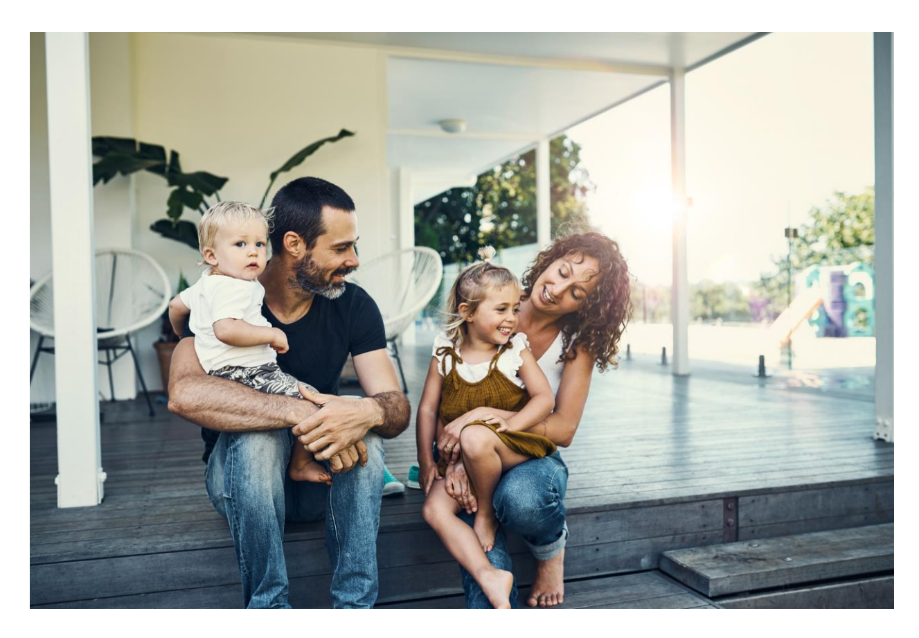
Parents of Young Kids Class